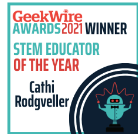
GeekWire Awards 2021, STEM Educator of the Year, presented to IGNITE Worldwide's CEO & Founder